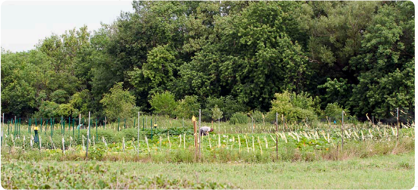
Farmette at Techny.

Divine Word Missionaries work in 70 countries around the world. Wherever we work, our missionaries bring the Gospel's Good News and work to address the basic needs of the people they serve.